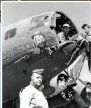
At Chelveston Bruce Bairnsfather applied his 'Old Bill' cartoon both to the mess wall and to the nose of a B-17.