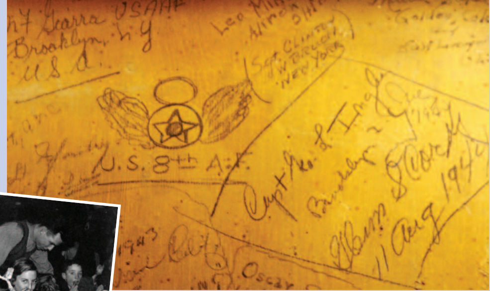
Above: Wartime signatures on a wall in the Swan at Lavenham.