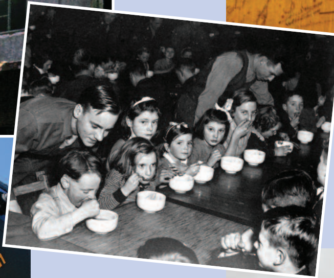
Left: A Christmas party for British children at Kimbolton.